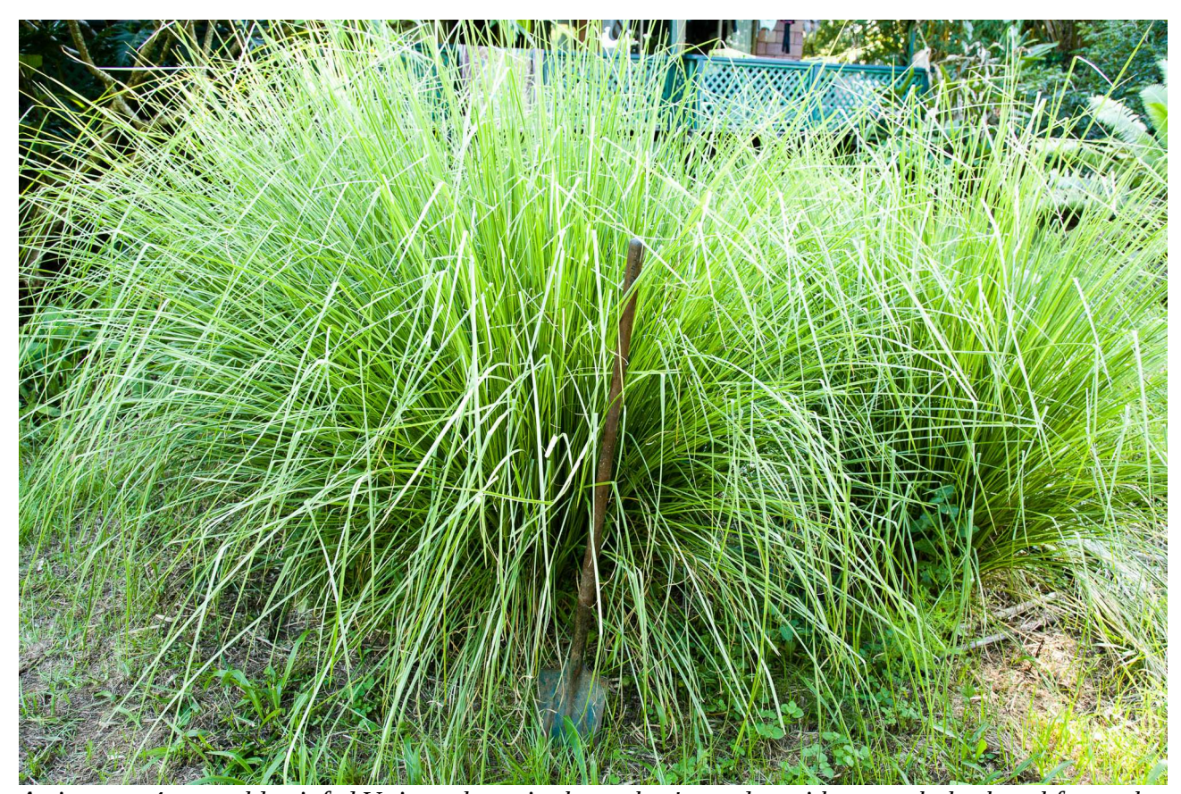
A vigorous 4 year old rainfed Vetiver clump in the author's garden with a post hole shovel for scale.

This document is a pictorial guide to one very common low cost method of propagating Vetiver for one type of application in the Vetiver System , usually unbroken hedgerows planted on or near the contour lines for soil and water conservation. For further information on propagation methods or more advanced planting applications, please visit the <u>Vetiver Website</u>. For updates and discussion, use the <u>Vetiver Blog</u> and <u>Vetiver Facebook Group</u>.