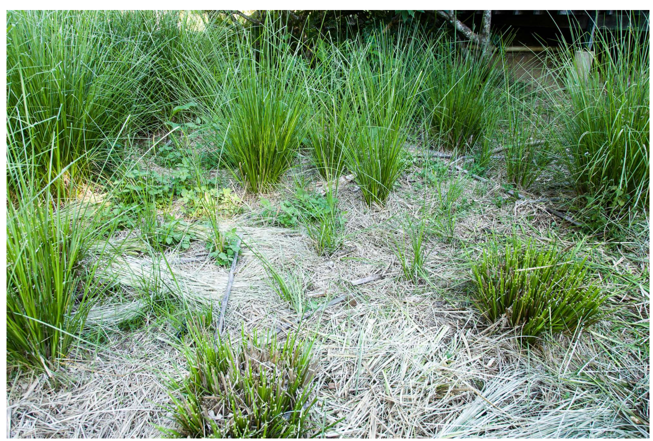
A rainfed nursery in a depression with plants in varying stages of growth as they are removed and replaced. Notice clumps that have been trimmed versus untrimmed. Trimming may accelerate tiller formation when performed at the right time.